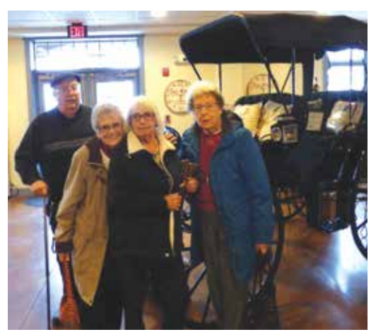
Belhurst Castle Lunch Outing