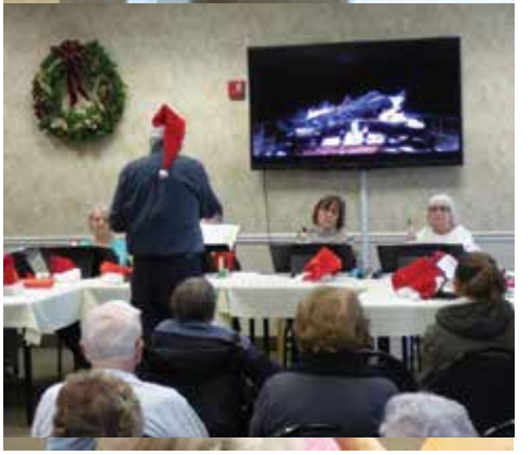
Bell Choir Concert