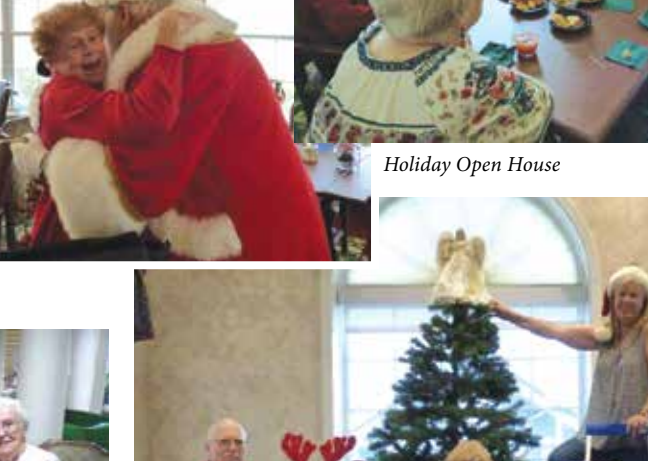
Decorating the Tree