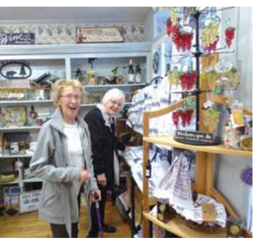
Brews & Brats Lunch Outing