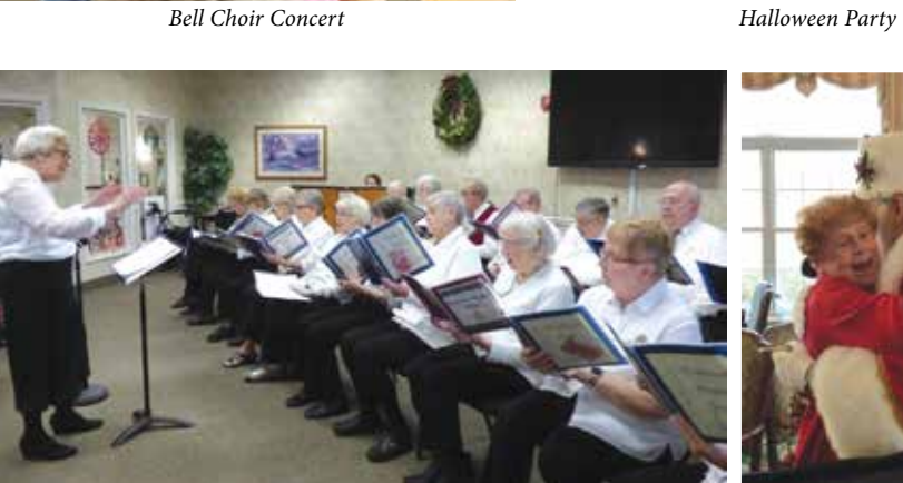
PWH Chorus Holiday Concert