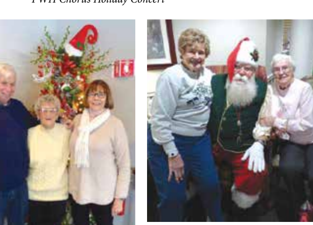
Holiday Open House